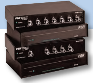
CVD-4/6 Composite Video Distribution Amplifier